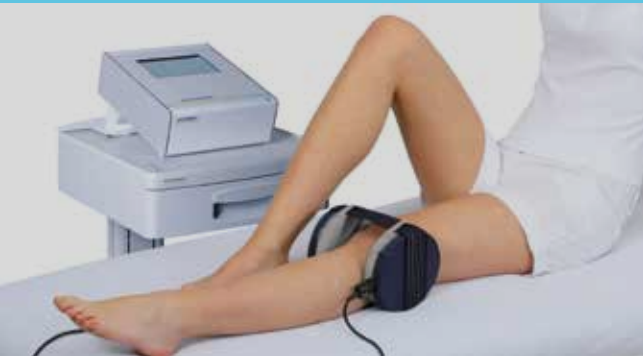
Magnetotherapy with set of applicators