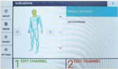
The detailed indication menu with practical filter functions

MFC technology focuses the magnetic fields almost entirely on the inside of the cylinder. This avoids unnecessary exposure of the treatment team.