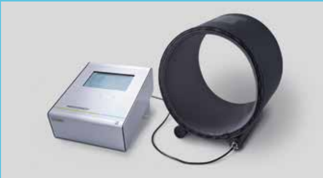
Cylinder, Ø 30 cm for magnetic field therapy of the limbs and head

MAG-Expert with anthrazit Coil Ø 60 cm integrated in a therapy couch – pillow included – for magnetic field therapy of the spine, pelvis and the whole body