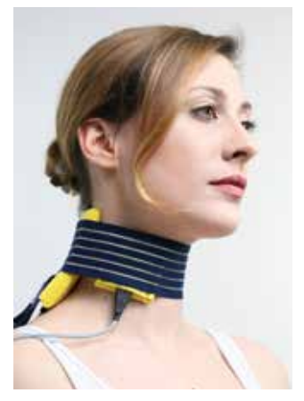
Electrode system for unilateral laryngeal paresis

Patient or therapist then trigger the stimulating pulses by means of a hand button precisely at the point that the patient requires this assistance. After preliminary training by the doctor/therapist, the patient can also carry out themselves the tone and vocal exercises tailored to their clinical picture. For the greatest possible regeneration effect, the exercises are flexibly adapted by regular changes in the therapeutic process to the current degree of damage.