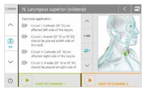
T/R sync (parallel operation of T/R with different intensities / indication: Laryngeus superior Parese bilateral)