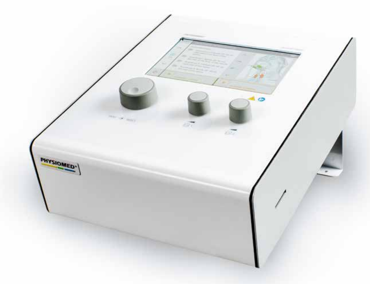
vocaSTIM® Master Professional electrotherapy and -diagnostics for doctors, therapists and speech therapists

The aim of stimulation current therapy in the treatment of patients with swallowing and voice disorders is to prevent atrophying of the paretic muscle and to accelerate regeneration <sup>1</sup>. Swallowing and the musculature responsible for voice formation are assisted by electrostimulation.