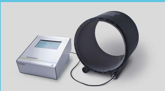
Cylinder, Ø 30 cm for magnetic field therapy of the limbs and head

MAG-Expert with anthrazit Coil Ø 60 cm integrated in a therapy couch – pillow included – for magnetic field therapy of the spine, pelvis and the whole body