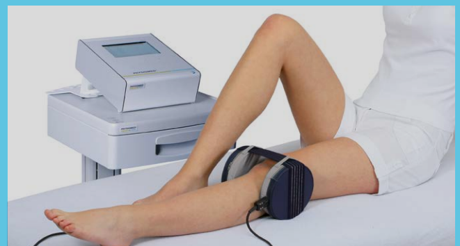
Magnetotherapy with set of applicators