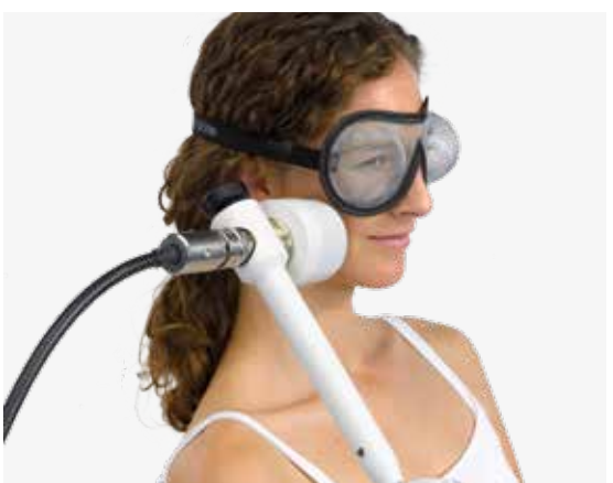
ENT application with a small emitter